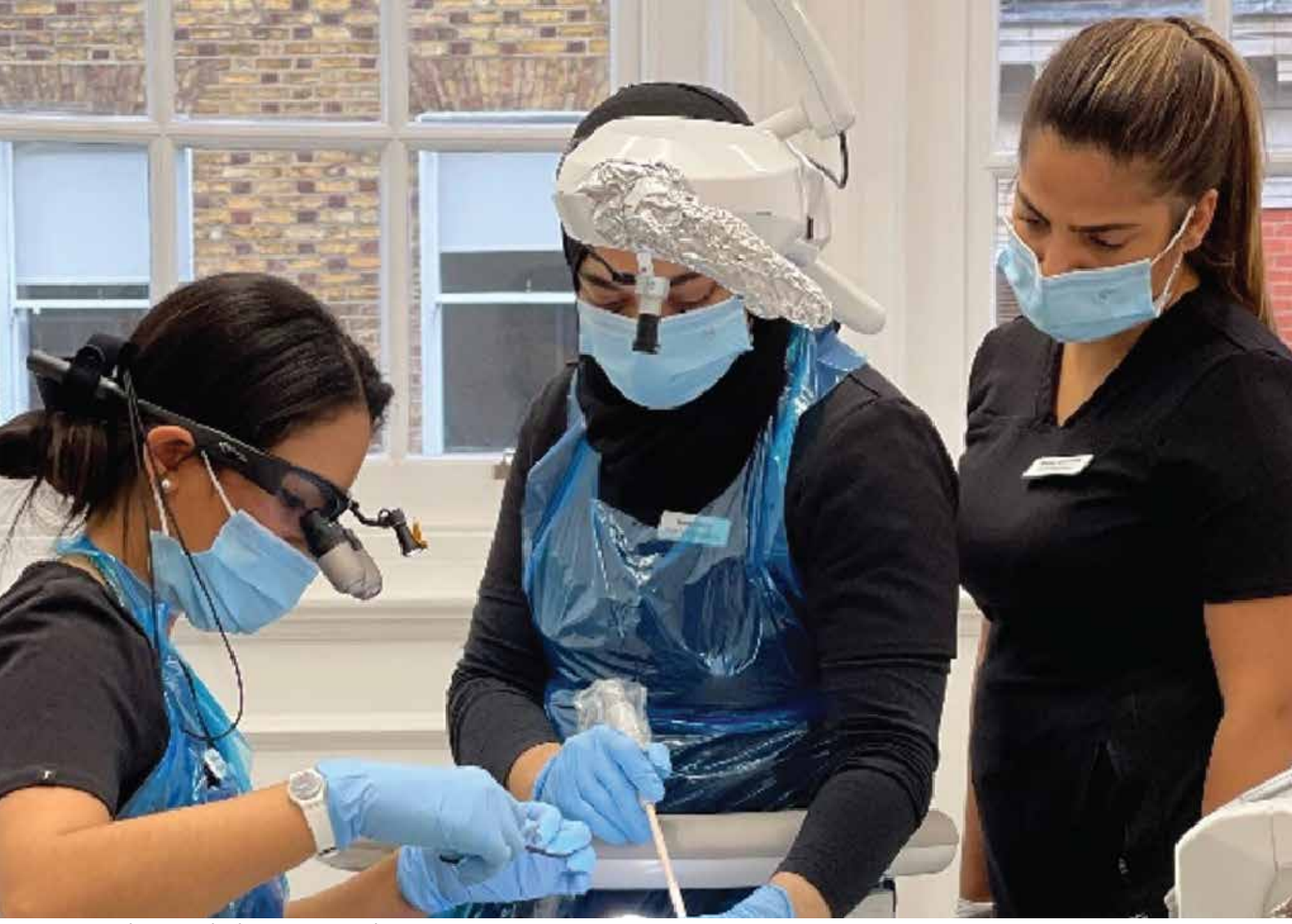
Reflective Clinical Practice

The module aims to cultivate reflective practitioners by fostering the development of innovative and reflective thinking alongside problem-solving skills.. Reflective practice serves as a vital tool for enhancing clinical judgment and building medical expertise, encouraging a thoughtful and evidence-based approach to clinical care.